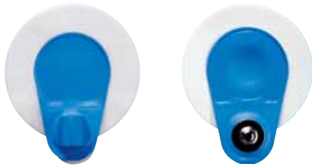
M-00-A; 4mm fitting M-00-F; 3mm fitting