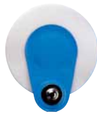
SP-00-S stud BIOAMSP00S