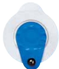
L-00-S stud BIOAML00S