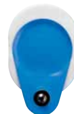
T-00-S stud BIOAMT00S